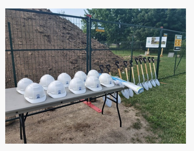
Build site of the new Beavercrest Community School, which sits next to the current school's location

Meanwhile in Markdale, a junior kindergarten to Grade 8 replacement build for <u>Beavercrest</u> <u>Community School</u> is underway with shovels in the ground following a <u>sod turning ceremony</u> on July 6, 2023. Municipal site plan approval, the building permit, and the construction tender are in place. Due to growing enrolment, the construction of two additional classrooms (to complement the previously approved build design) is being proposed. Details on an opening date will be shared once confirmed.